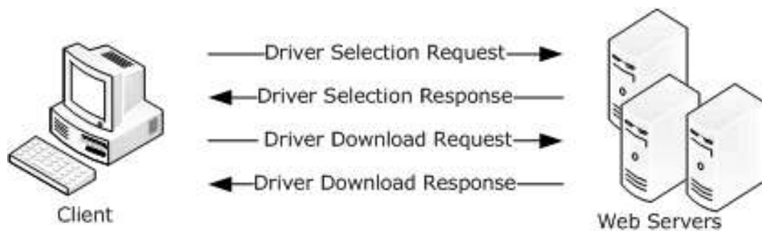
Figure 1: Client selection and download of printer driver

A Web Point-and-Print Protocol web server maintains a list of printer drivers. A client makes a Driver Selection Request (section 2.2.4) to obtain a printer driver of a particular type and for a particular client configuration. If the server locates a printer driver that matches these requirements, the server redirects the client to the location of the printer driver through the Driver Selection Response (section 2.2.5).